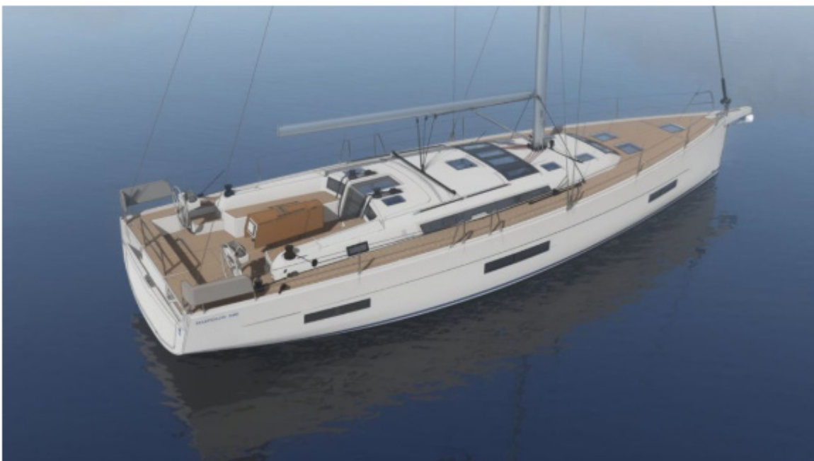
Dufour 530 Ocean

The "Easy" version is the most simplified version, adapts to owners and charter customers looking for simplicity. She has a roof clear of any clutter with manoeuvres reported to the coamings.